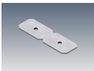
JN-ST Straight joiner