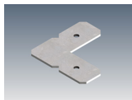
JN-90 90 degree joiner